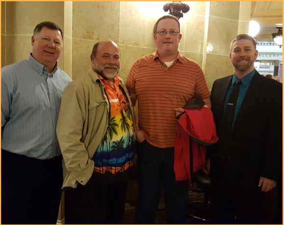
Waiting for bill signing outside the Governor's office.