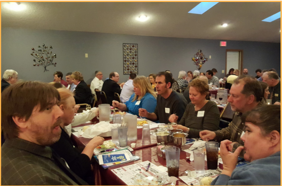
Columbus CVB Meeting