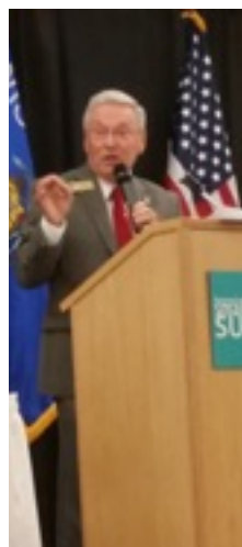
Senator Terry Moulton