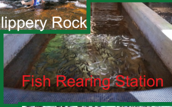
Fish Rearing Station