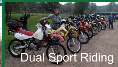
Dual Sport Riding