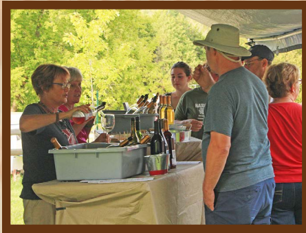
Wine always tastes better in the Valley!