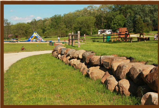
GV's wall adds immensely to the Valley!